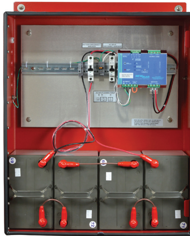
12-24-48V, 18 - 100AH 26" x 22" x 10" Case A