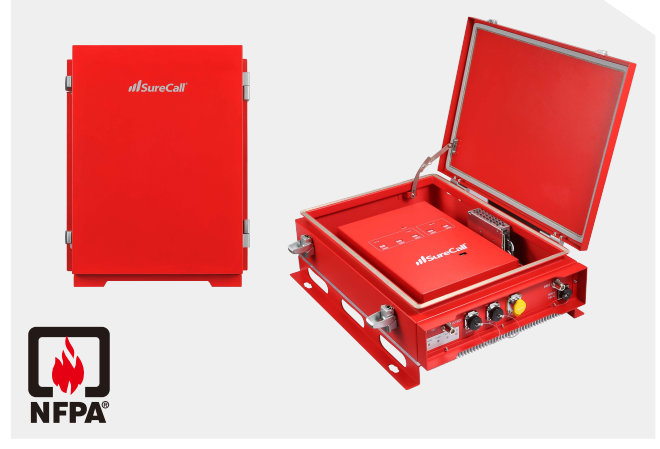
SureCall Guardian3 QR Bi-Directional Amplifier with Nema4 Rated Enclosure