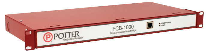
FCB-1000RM Fire Communications Bridge Rack Mount