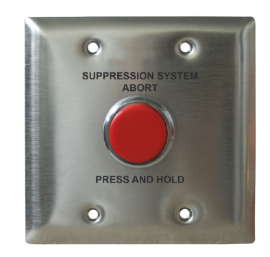
Stock number: 3001000 - RED BUTTON 3001004 - BLUE BUTTON