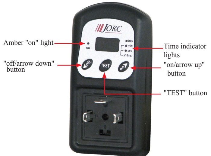
Fig. 1 Timer Diagram: