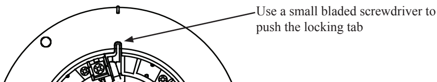
Figure 2. Removing of detector head from base