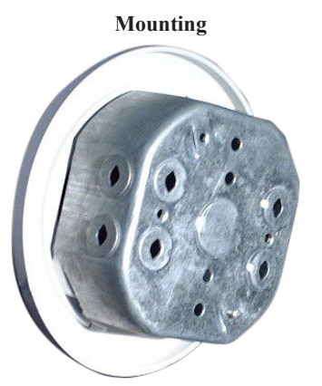
Devices mount on a 4" octagon backbox. The provided mounting ring covers wall and plaster imperfections.