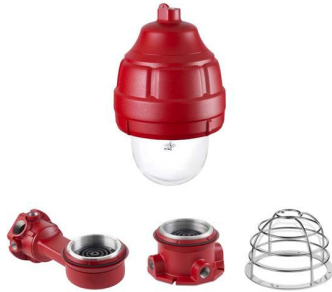
(Shown with pendant mount. See how to order for mounting options)