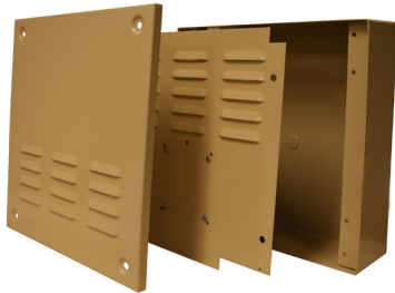
ABB-1012 INDOOR/OUTDOOR STEEL BELL BOX