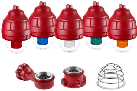
(Shown with pendant mount. See how to order for mounting options)